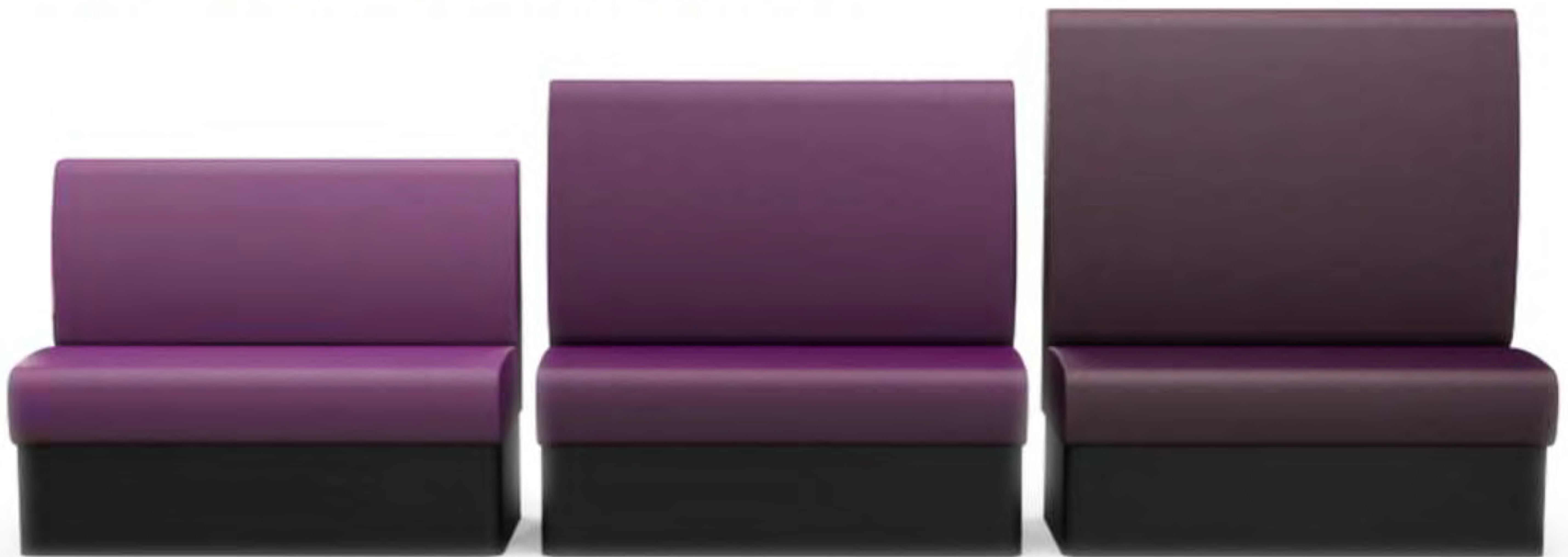
Standard Height 930mm