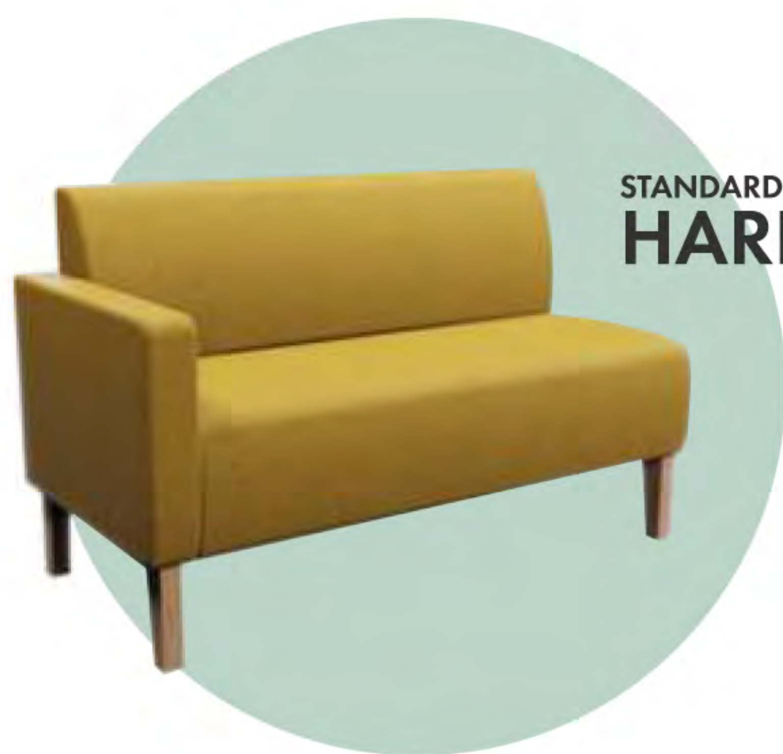
STANDARD HEIGHT HARROW