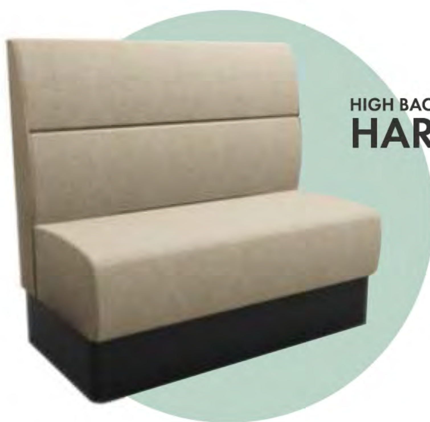
HIGH BACK HARROW