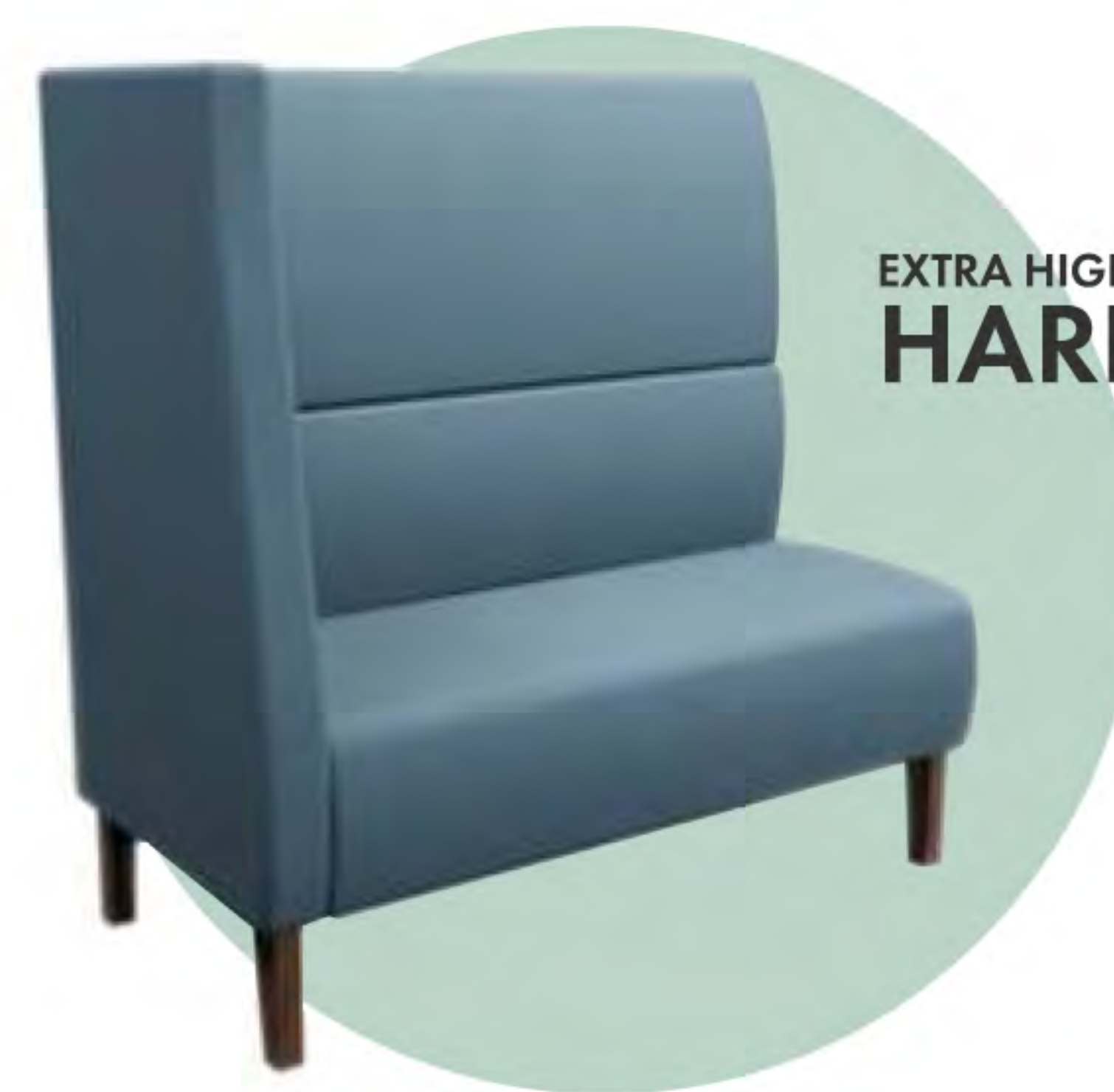
EXTRA HIGH BACK HARROW